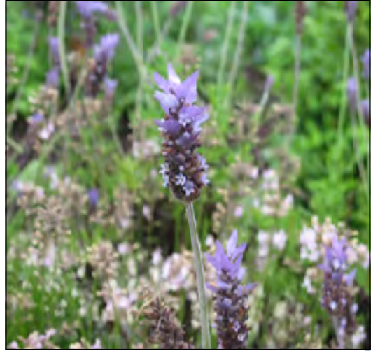
One of the many flowers found in the gardens

While you're in the Royal Burgh, you can explore the plants in the palace gardens and try to match up which ones were used for which ailments!