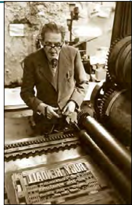
The traditional printworks at Robert Smail's

Don't forget to pop into the shop after to find Robert Smail's special literary themed gifts.