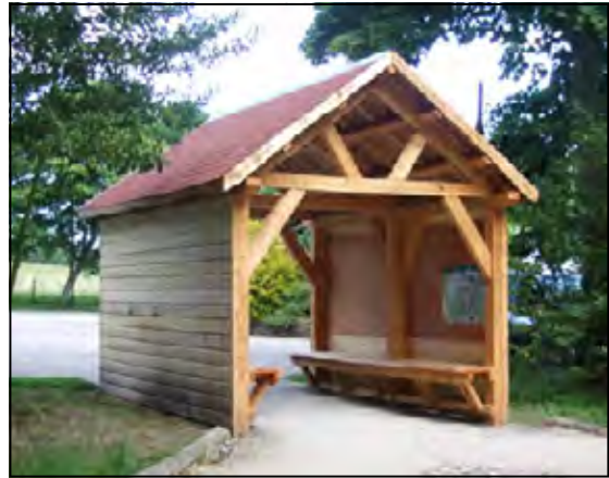
Shelter built by a Thistle Camp volunteer team

This exciting property has played host to a variety of volunteering projects in the last year—from team building Corporate Challenges to shelter building Thistle Camps.