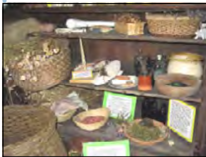
Some remedies on display

Culross is the most complete example in Scotland of a 17 th century Royal Burgh, and this is the perfect way to learn about such an interesting time in the history of Scottish people.