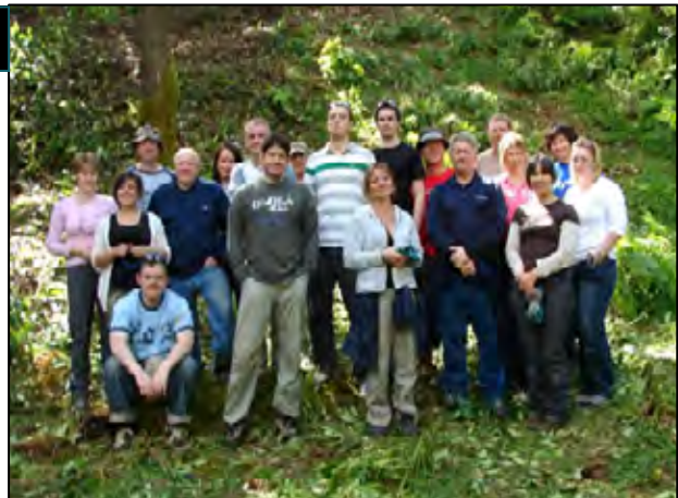
Taking a break from the hard work to pose for a photo

The Trust would like to thank all the volunteers involved and hope that they will come back and see the continued impact their work has helped to create.