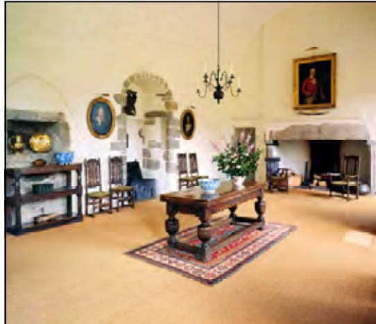
The Great Hall at Castle Fraser

However, earlier generations, sharing the same name, left me baffled. In between times, I paced around my kitchen,