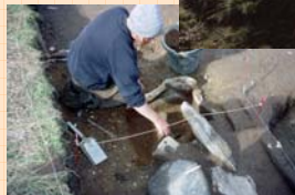
Early Christian long cist burial