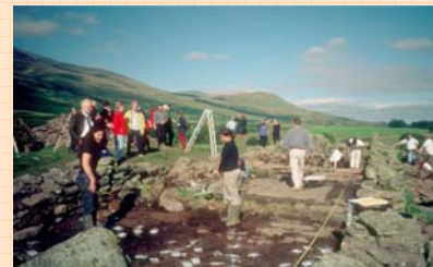
Guests during the official launch of the project visited our excavations in progress

As well as getting funds from the NTS, the project receives grants from the Heritage Lottery Fund, Historic Scotland, Scottish Natural Heritage, and the Russell Trust. We also receive help in-kind from RCAHMS, from Glasgow University Archaeological Research Division, and from many other partners.