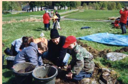
Children taking part in a test excavation in Glen Lyon

One way to help secure the future for the remarkable historic landscape on the north side of Loch Tay is to get local people to help. The project includes the involvement of children from local primary and secondary schools, who have been finding out whether they would make a good archaeologist, and how to be landscape detectives.