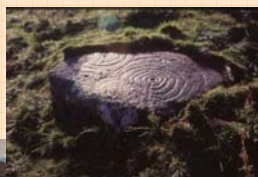
Prehistoric cup-and-ring-marked rock

We now have evidence for human activity at Ben Lawers for at least 9000 years. Generations of hunters then farmers have left traces in the landscape.