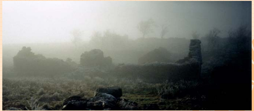
The landscape is steeped in the remains of past human settlement

Through detailed documentary research, archaeological survey and excavation we hope to piece together the human history of the landscape. We are working with those who live on and farm the land so that the archaeological remains will be preserved for the future.