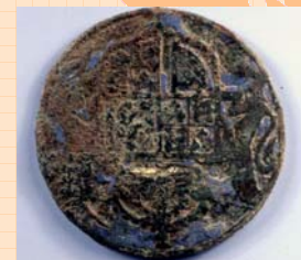
A late medieval token found during the courtyard excavations