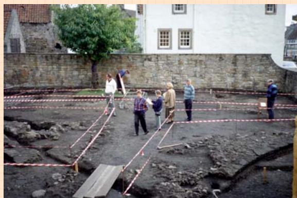
Visitors viewing work in progress during the dig Open Day