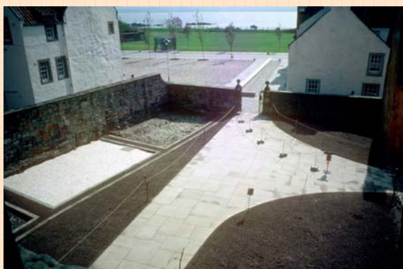
The reconstructed courtyard, with the smithy (white) marked out on the left