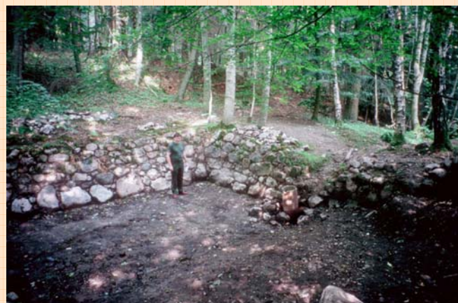
The Crathes ice pond after excavation, showing the roughly-cobbled bottom, sloping up for ease of access