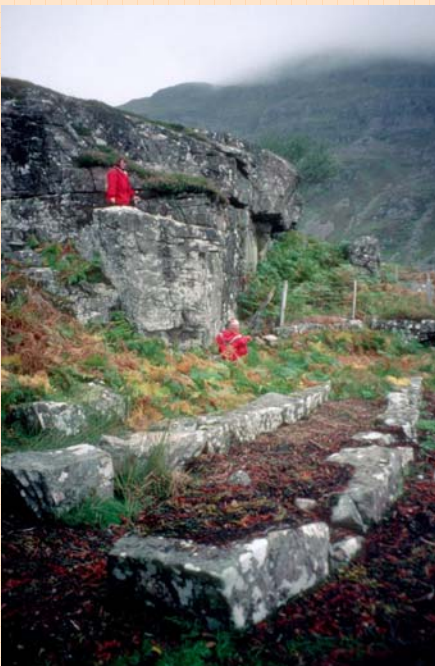
A pulpit rock overlooks the stone benches of the Torridon open-air church