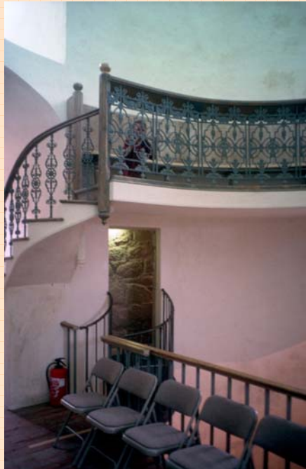
The newly discovered opening leading to the Alloa Tower well chamber

During the same building works on the Clackmannanshire tower, archaeologists were thrilled to find that a fireplace – itself blocked in the 17th century – concealed a beautifully made well chamber, part of the first phase of the tower. The location of the well at this height shows that the kitchens must also have been on first floor level, and not on the ground floor as might have been expected.