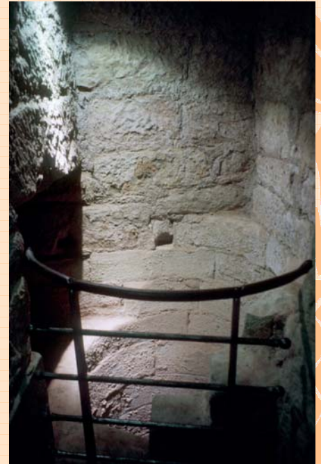
High-quality stone was used to create the chamber for the well