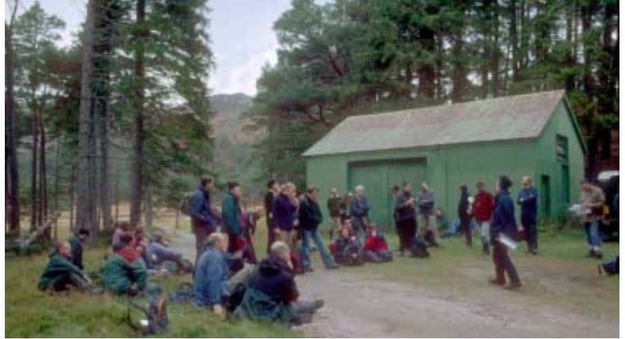
Conference participants considering the future options for Derry Lodge

A couple of weeks later, in mid-October, the Trust hosted what may be the last ever annual get-together of National Trust and NTS archaeologists. The week-long event took us out into the Cairngorms and over to Drum and Crathes estates, but also included very stimulating discussions on the future of Derry Lodge,