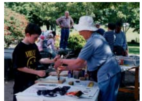
"And they said 'Ancient Skills' would be boring ...!" Drilling a hole with a wood and flint bit