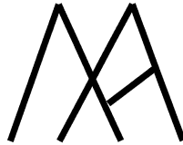
Double inverted Vs, as at Craigievar, symbolising the Virgin Mary

The Pitmedden discovery is unusual in that the marks appear on a portable object, and to date we have not found any other object in the Region with similar markings.