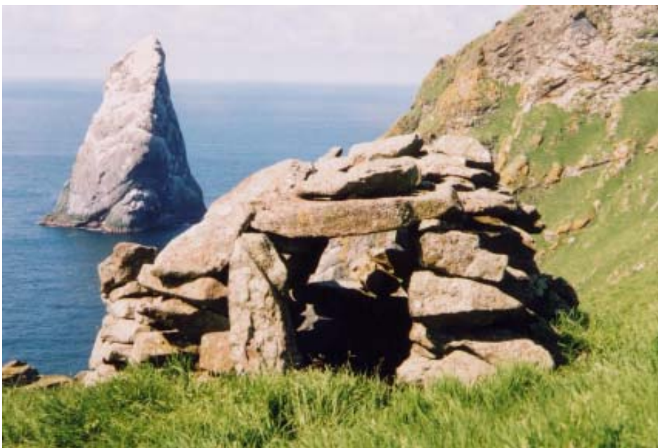
A Boreray cleit with Stac Li in the background

Jill Harden NTS Highlands & Islands Archaeologist