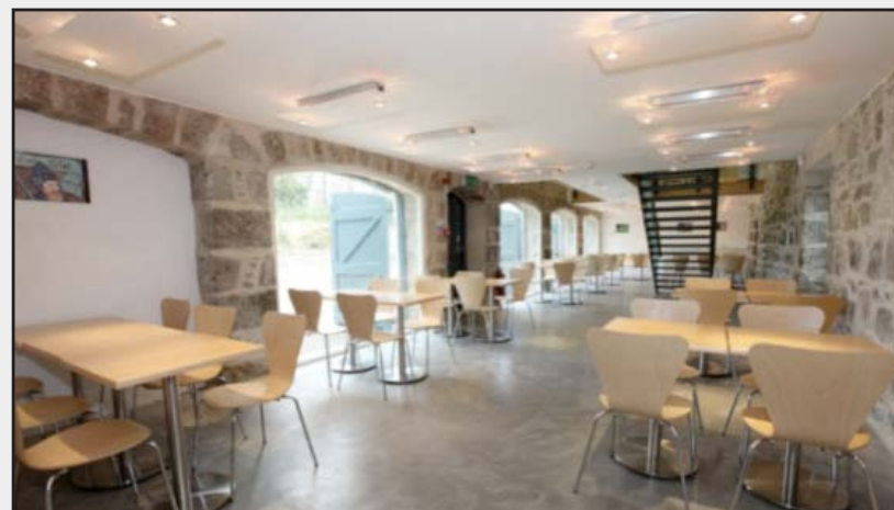
Courtyard Conference Cafe