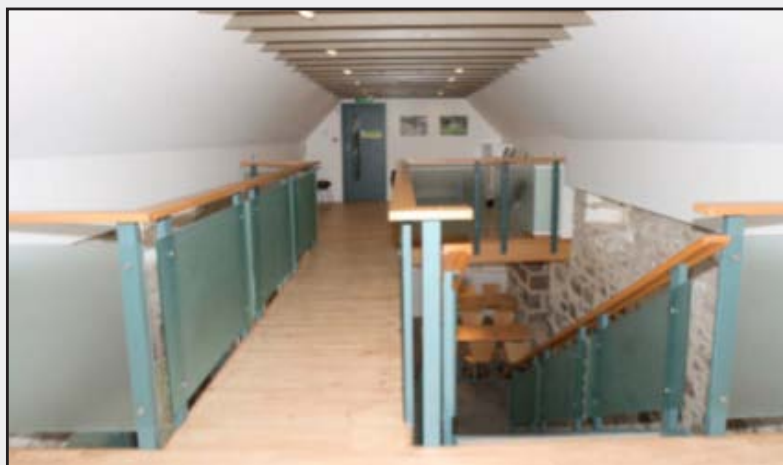
View to Breakout Area & Stairs down to....