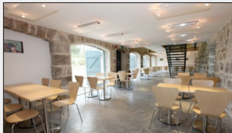
Courtyard Conference Cafe